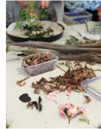
A collection of natural items – suggested items are pebbles, rocks, shells, sand, flowers, sticks, bark, leaves (brown and green), seed pods, nuts, dried legumes.