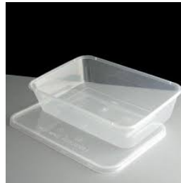
Plastic containers or snap seal bags