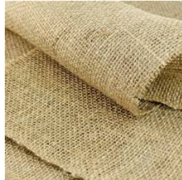
Hessian/natural fabric for liner